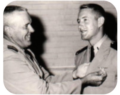
A young Hank Brown in the U.S. Navy.