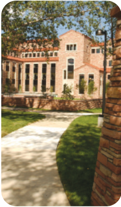
The Wolf Law Building at the University of Colorado Law School.

For Hank Brown (JD '69), the University of Colorado Law School provided a rigorous professional education in an atmosphere befitting his stalwart leadership abilities. Since then, he has pursued a lifetime of achievement and service to society at every turn. Throughout a career that has included the U.S. Navy, Monfort of Colorado, state and federal elective office, the Daniels Fund, and the presidency of the University of Colorado, Brown's leadership and civic commitment have exemplified the highest hopes we have for our graduates.