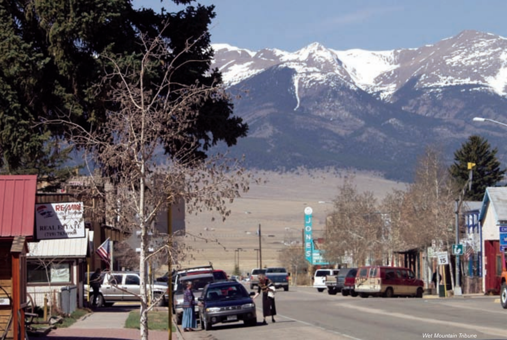
Wet Mountain Tribune

These two stories illustrate just how little health care has changed in rural America over the past 70 years. The impact is huge.