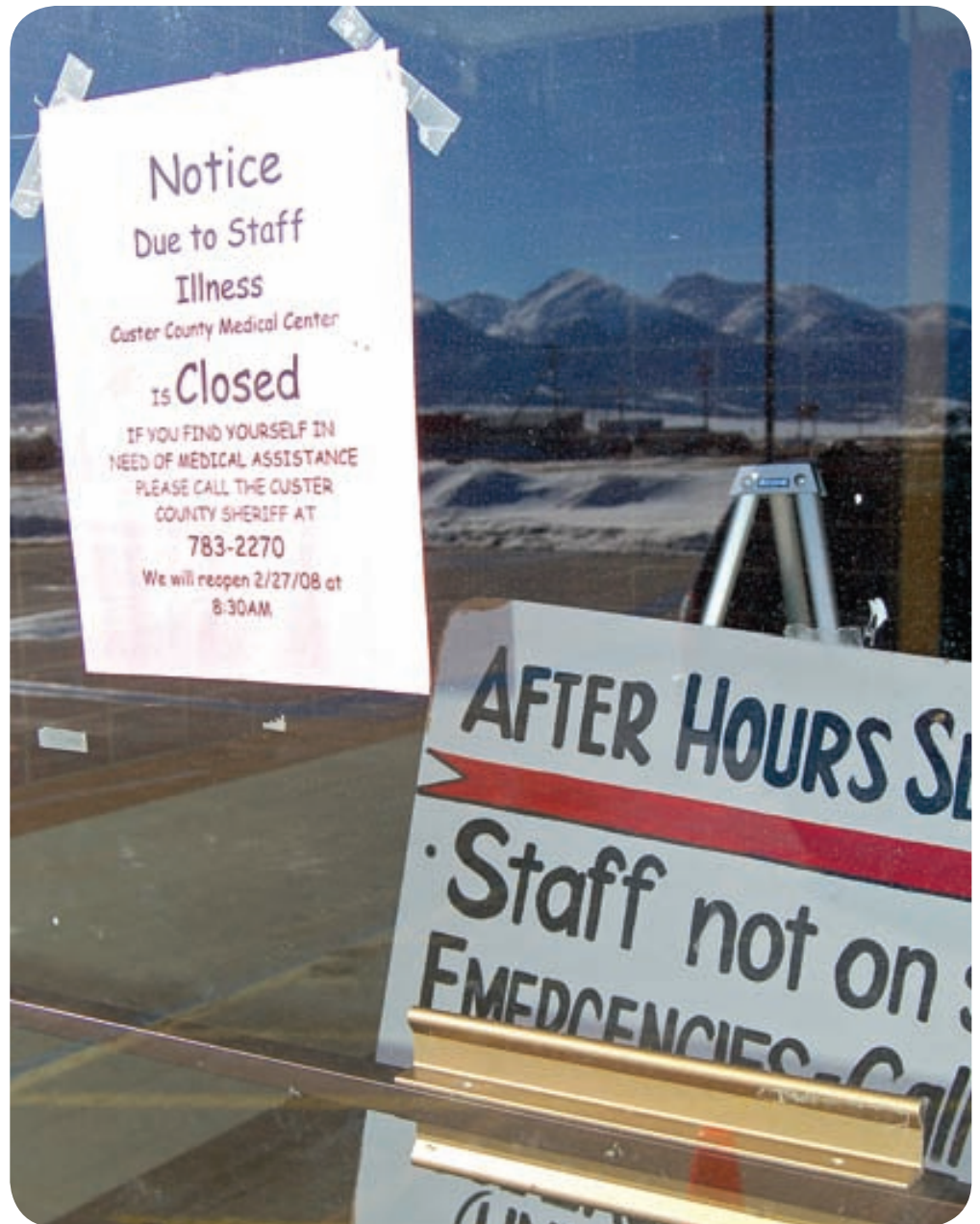
Wet Mountain Tribune