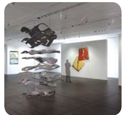
A proposed gallery view of the CU Art Museum.