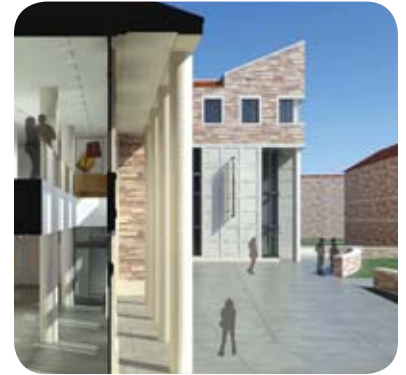
An outdoor plaza will be a community gathering place.

Since 2007, the CU Art Museum has lacked a permanent gallery. But when the Visual Arts Complex is completed, it will include one of Colorado's most significant museums and will serve as a major Front Range cultural resource. It will feature upgraded, climate-controlled exhibition and storage space, as well as designated areas for receiving, art preparation, and fabrication. And the Visual Arts Complex will merge CU-Boulder's rural Italian architectural flavor with a modern, visitor-friendly design that incorporates LEED green-building practices.