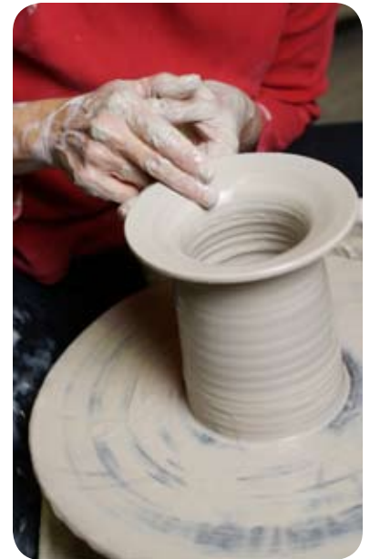
The ceramics program is among the most highly regarded in the nation.