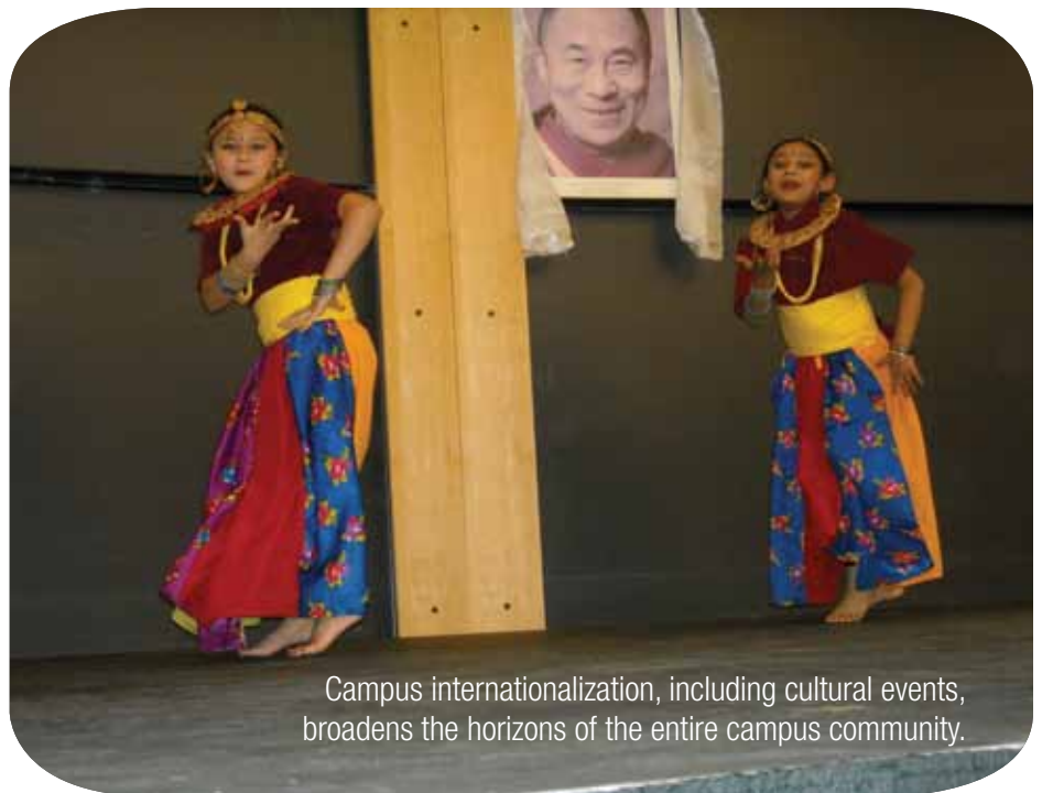
Campus internationalization, including cultural events, broadens the horizons of the entire campus community.

and triple the number of international students who study on our campus. We will build on-campus and community traditions that celebrate culture and utilize technology to internationalize the classroom experience.