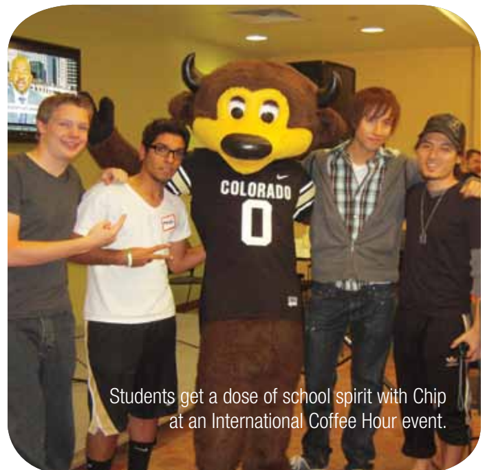
Students get a dose of school spirit with Chip at an International Coffee Hour event.

Cultural Programming: CU-Boulder has numerous longstanding cultural traditions and programs that celebrate some of the more than 80 countries our campus population represents. Your gift can underwrite our annual International Festival, weekly international coffee hours, host-family programming through our partnership with Boulder Friends of International Students, or an enrichment fund for international student groups.