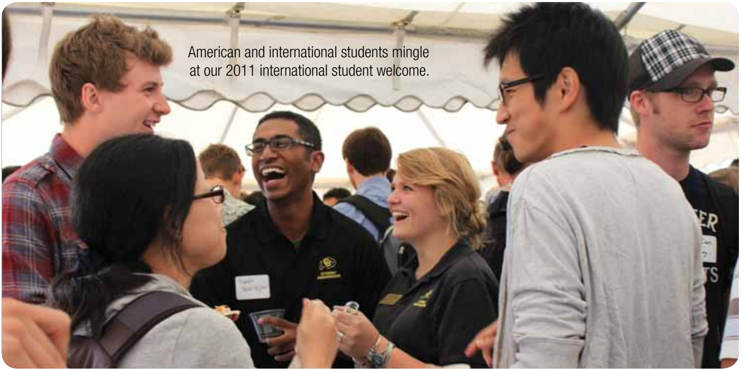
American and international students mingle at our 2011 international student welcome.