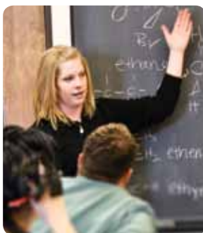
An undergraduate Learning Assistant, leading a discussion

First implemented at CU-Boulder in 2003, CU-Boulder’s Learning Assistant (LA) program has been replicated at 13 universities and received national recognition at a White House ceremony.